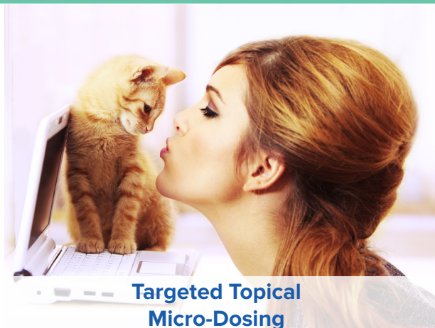
Targeted Topical Micro-Dosing

Revolutionary Way to Accurately & Easily Micro-Dose Topical Medications for Humans & Pets