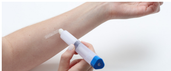
Targeted Topical Micro-dosing