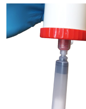
EMP Jar Quick-Fill Adaptor ™

EMP Jar Quick-Fill Adaptor ™ Filling: Screw-on EMP Jar Quick-fill Adaptor ™ . Fill topical medications directly from mixing jar with this added Micro ™ accessory.