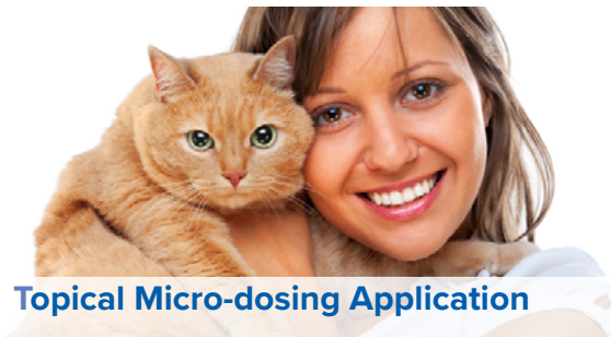
Topical Micro-dosing Application